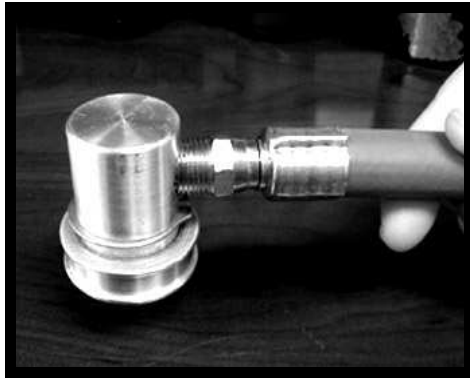
Step 1: Attach inflator tip to air hose.

GL Packaging Products - US Dunnage Air Bags