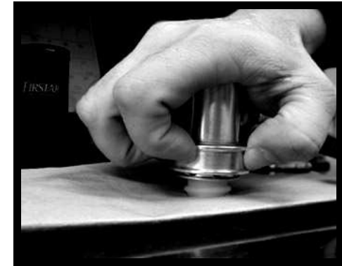
Step 3: While holding flange up, press tip onto valve.