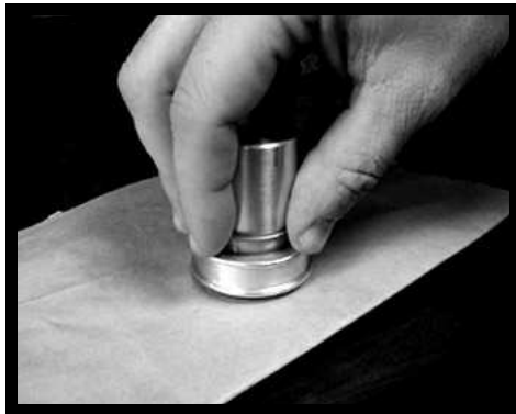
Step 4: Slide flange down to lock tip into position.