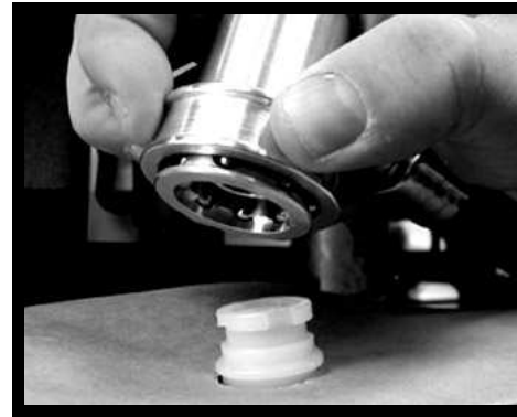
Step 2: Lift flange on inflator tip up to snap ring and stop.*